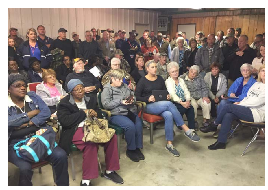
Valley Park, MS- Public Meeting – March 7, 2019