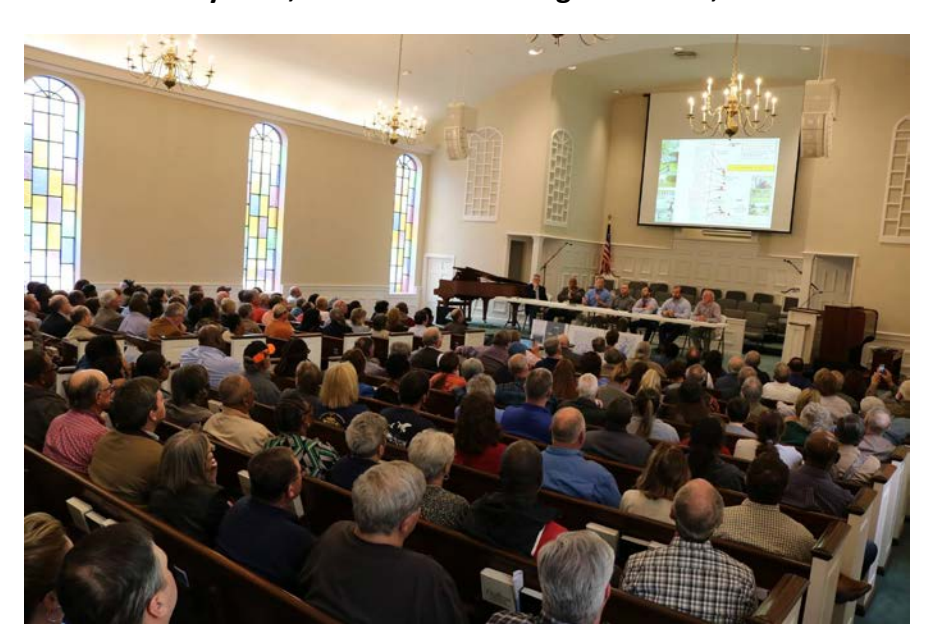
Rolling Fork, MS- Public Meeting - March 18, 2019