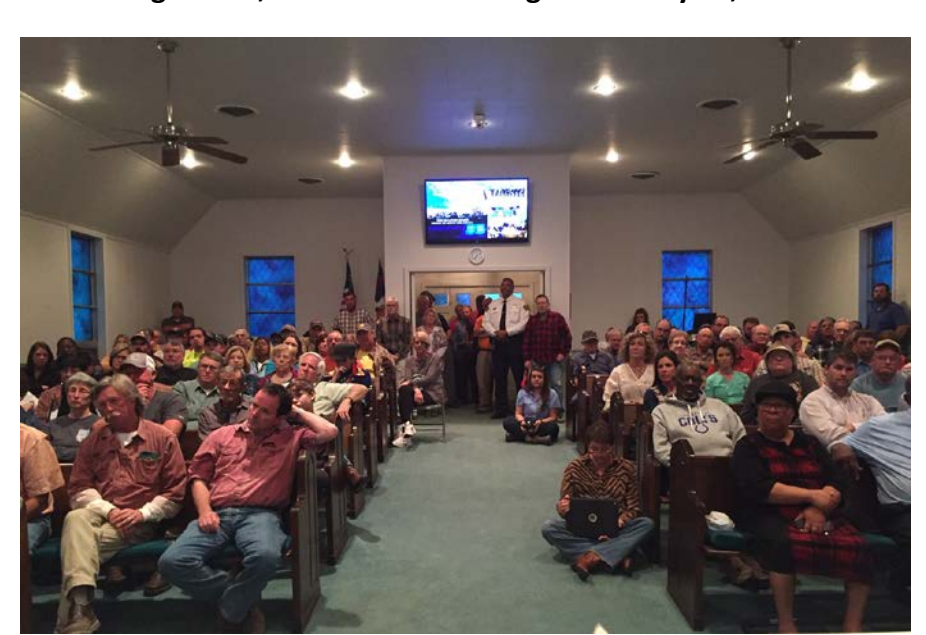
Holly Bluff, MS- Public Meeting - March 12, 2019