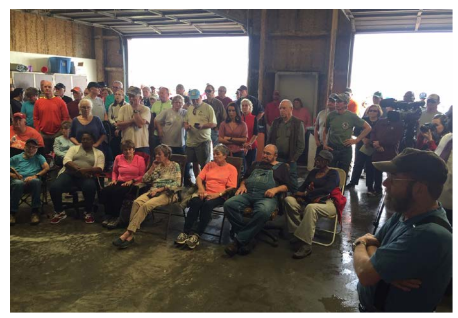
Eagle Lake, MS - Public Meeting - February 23, 2019